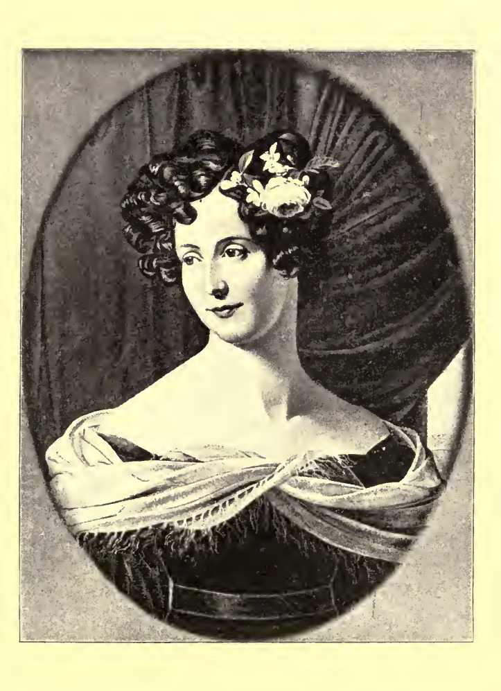
THE MOTHER OF GEORG EBERS.